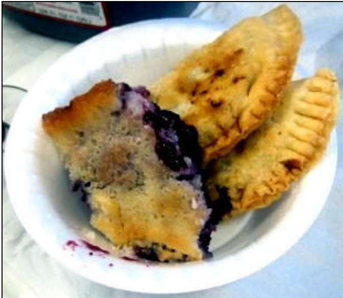
A sample of the cobbler and fried pies from last year.