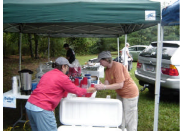
PICs from Shellmound